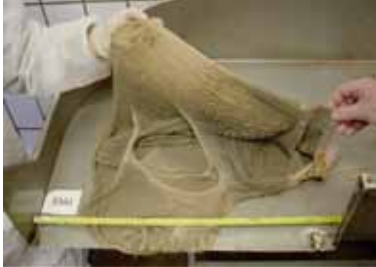
Average weight of rumen of 6 week old calves fed whole milk: 1.42kg