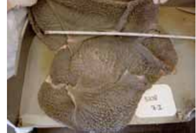
Average weight of rumen of 6 week old calves fed milk powder with NuStart: 1.89kg