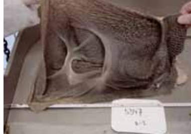
Average weight of rumen of 6 week old calves fed standard milk powder: 1.57kg